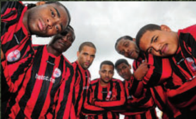
Star 66, recipients of a One Game, One Community grant

These projects have included activities with a focus on disability, travellers, refugees, faith and homeless groups, and Asian Muslim women and