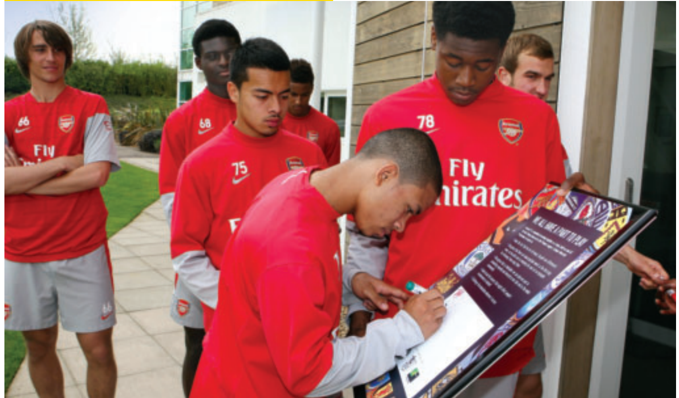
Scholars at Arsenal FC signing up to the ‘We all have a part to play’ poster and statement

“To watch English football in the 21st century means celebrating – and berating – players from all over the world. That multi-culturalism, I’m pleased to say, isn’t just obvious out on the pitch these days either. Over the course of the last decade, crowds at games here have started to look more and more like the England I know. And I’m proud of that. Kick It Out should be, too, because the organisation has played a key role in making it happen.”