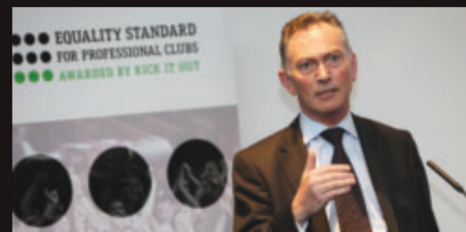
Premier League Chief Executive, Richard Scudamore at the launch of the Equality Standard in March 2009

Tranmere Rovers became the first club in 2009 to receive the new Equality Standard, and it is hoped that many clubs will move their work forward in this area over the next 12 months.