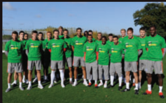
Rachel Brown, Everton Ladies FC and England goalkeeper

“We can act as role models to younger girls, and give them something to aspire to.”