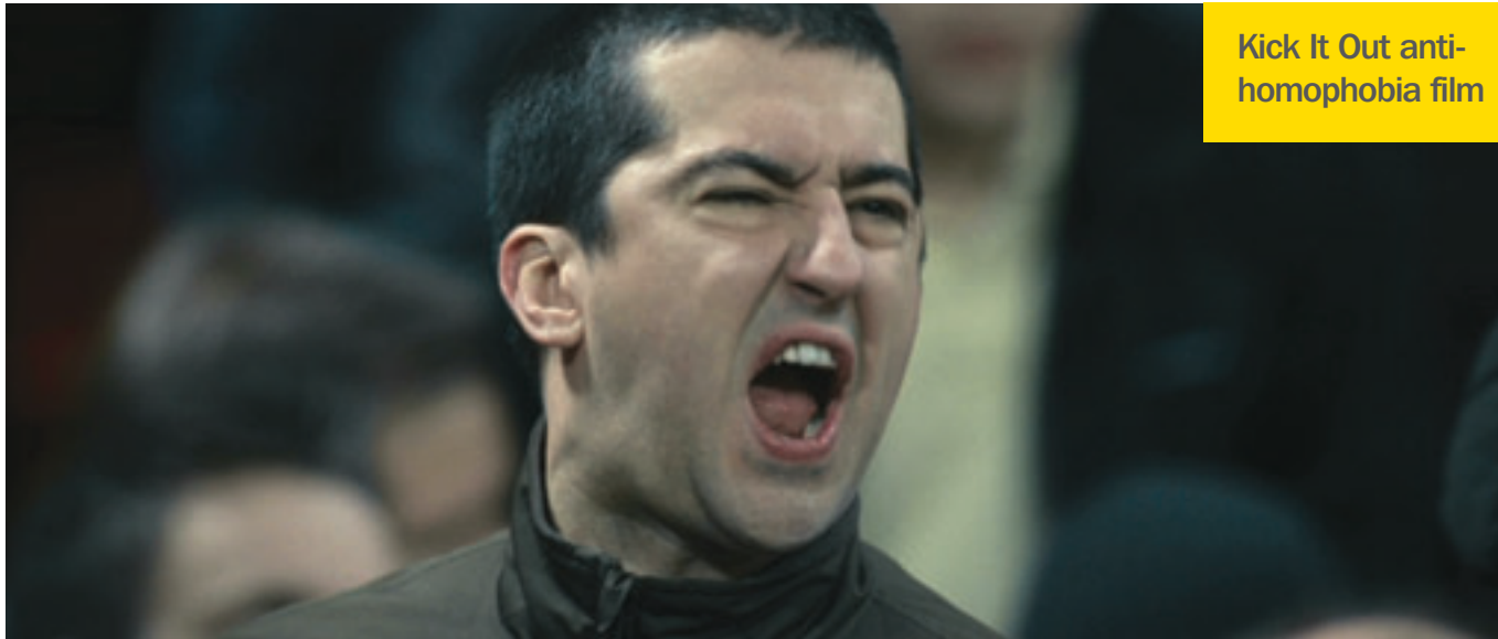
Kick It Out anti-homophobia film